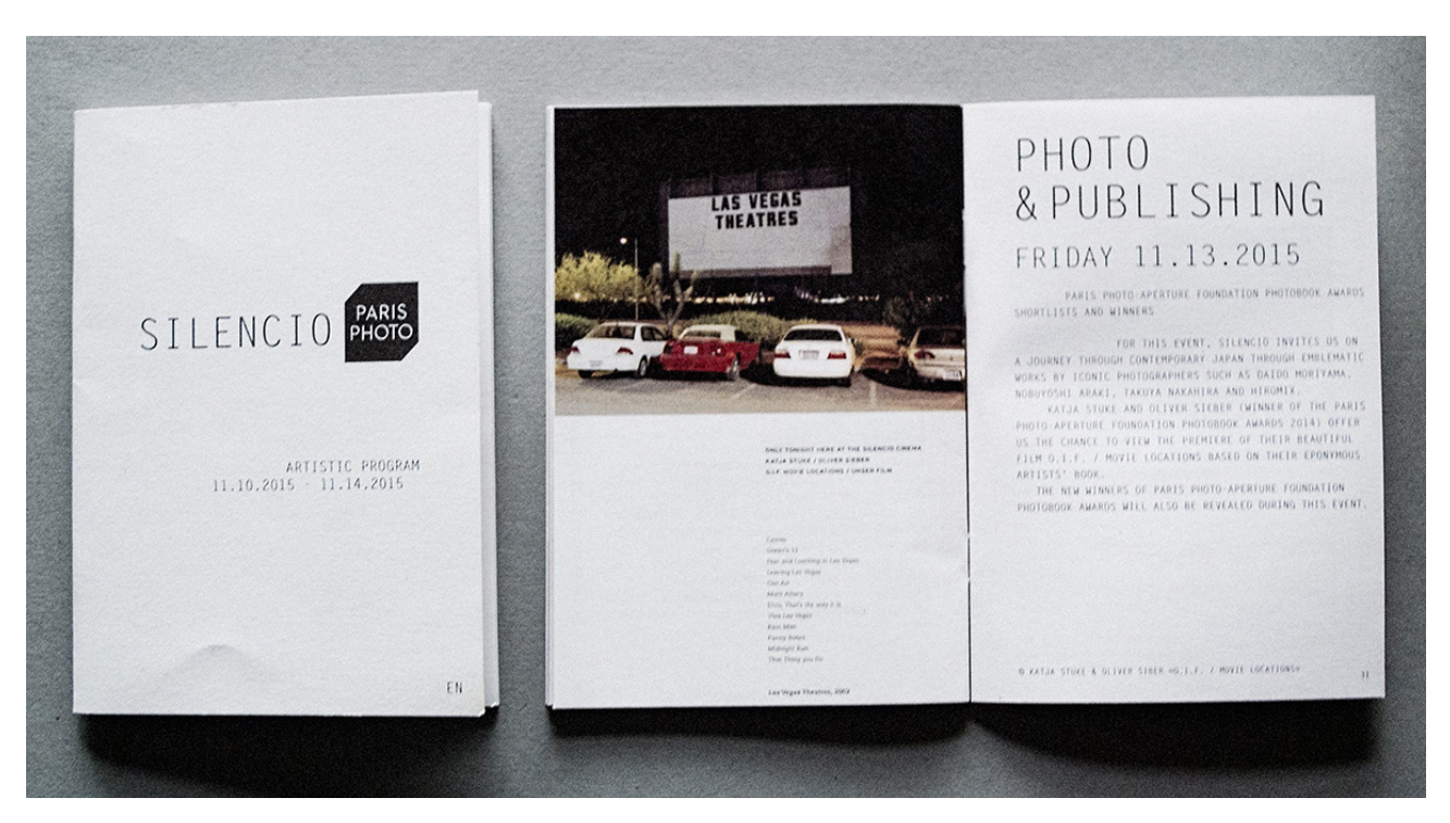
»O.i.F./Movie Locations« 2015 Aperture-Foundation/Paris Photo Night @Silencio