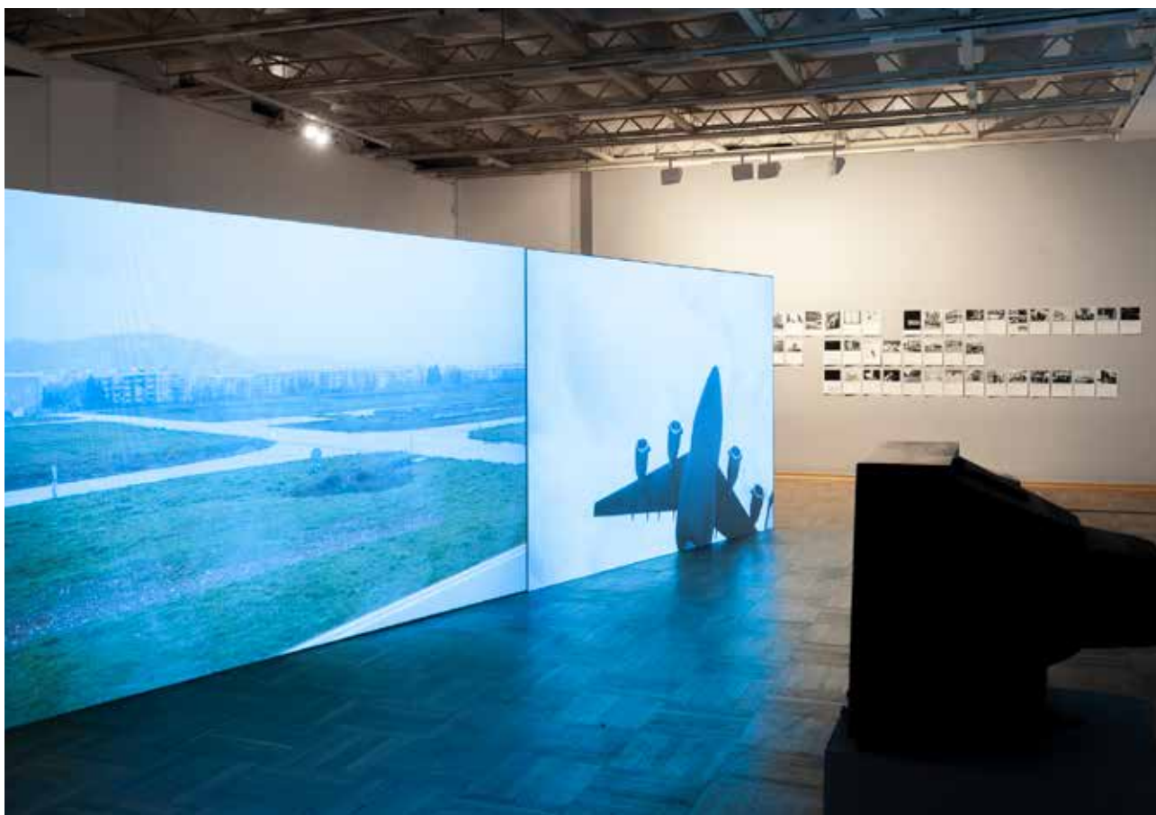
»You and Me« 2018 »Krakow Photomonth« curated by Iris Sikking, Bunkier Sztuki Krakow