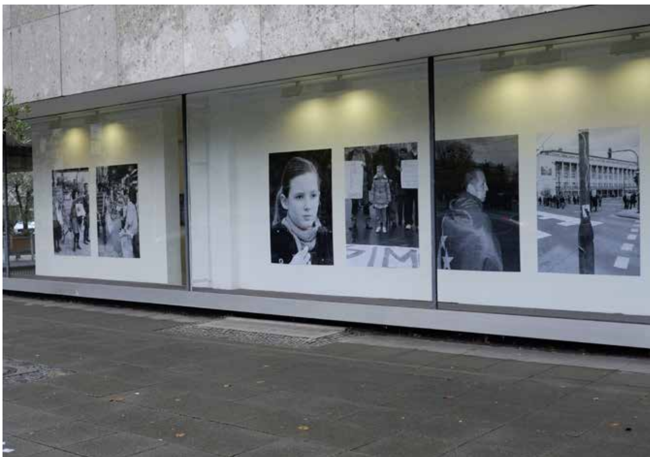
below: »You and Me« Scope Hannover 2016

Window: #6, Imagine there's no countries