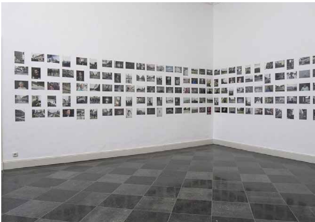
»You and Me« Kunsthaus NRW, Aachen Kornelimünster 2016 incl. 195 prints, 3 videos and publications