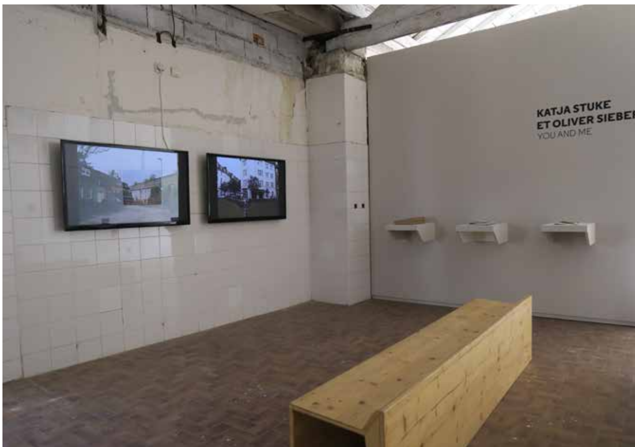
above: »You and Me« Cosmos Croisière, Rencontres d'Arles, 2 channel-video