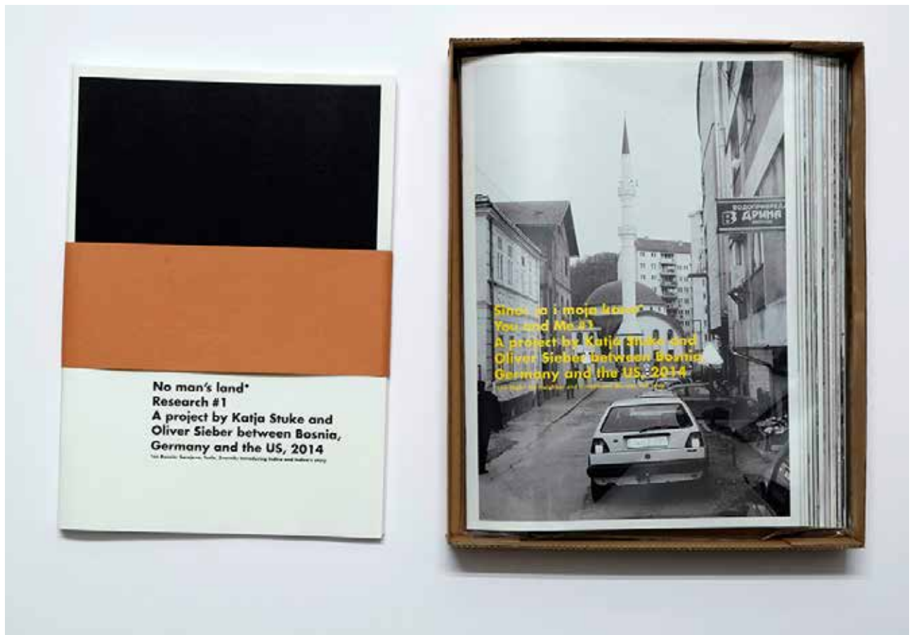
»You and Me« published by Spector Books, Leipzig / 458 pp. 24 x 31 cm, 115 b/w, 235 colour images 22+5 saddle-stitched booklets in a box Language(s): Bosnian, French, German, English; ISBN: 9783959051316