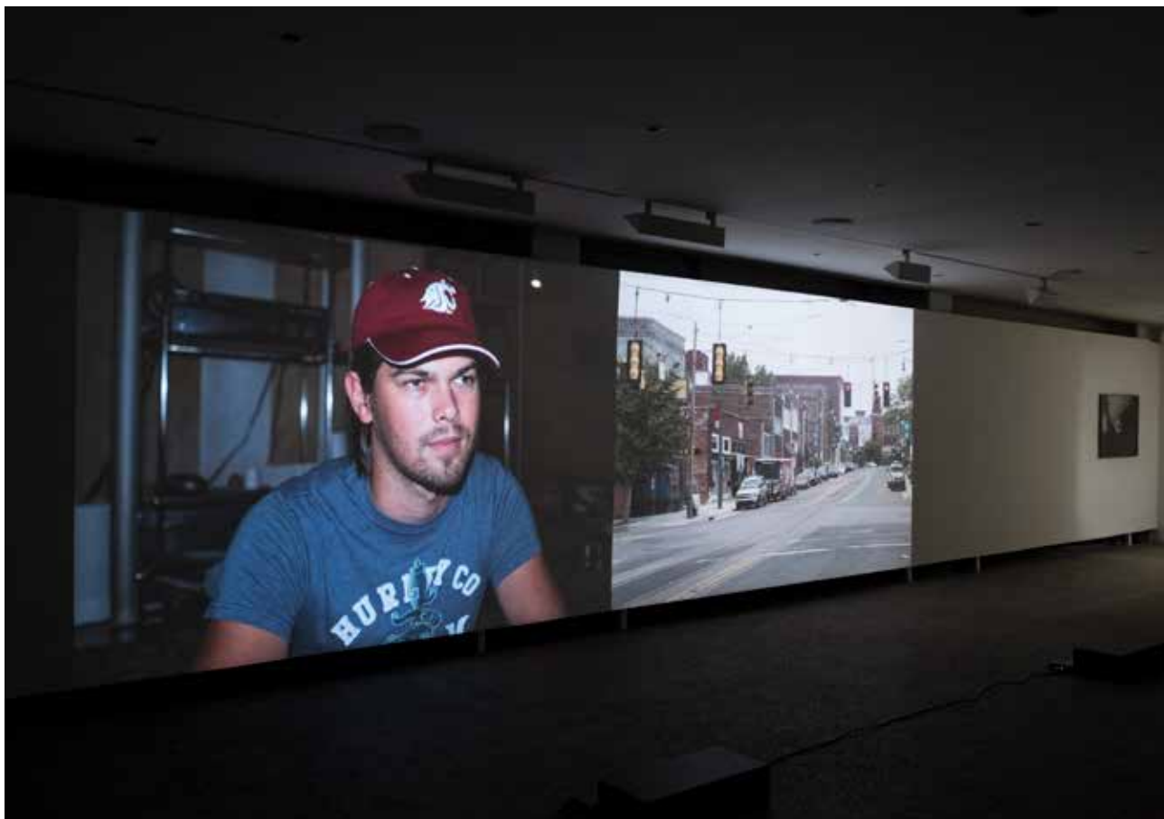
»You and Me« Scope Hannover 2016

Gallery 4: 2-channel-projections projection: https://vimeo.com/191517627