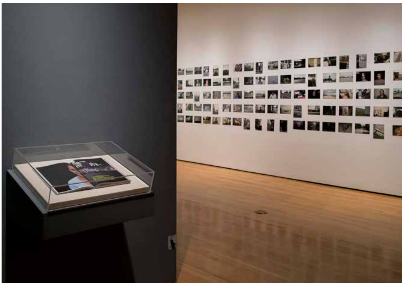
»You and Me« Museum of Contemporary Photography Chicago 2015 incl. 195 prints, 3 videos and publications