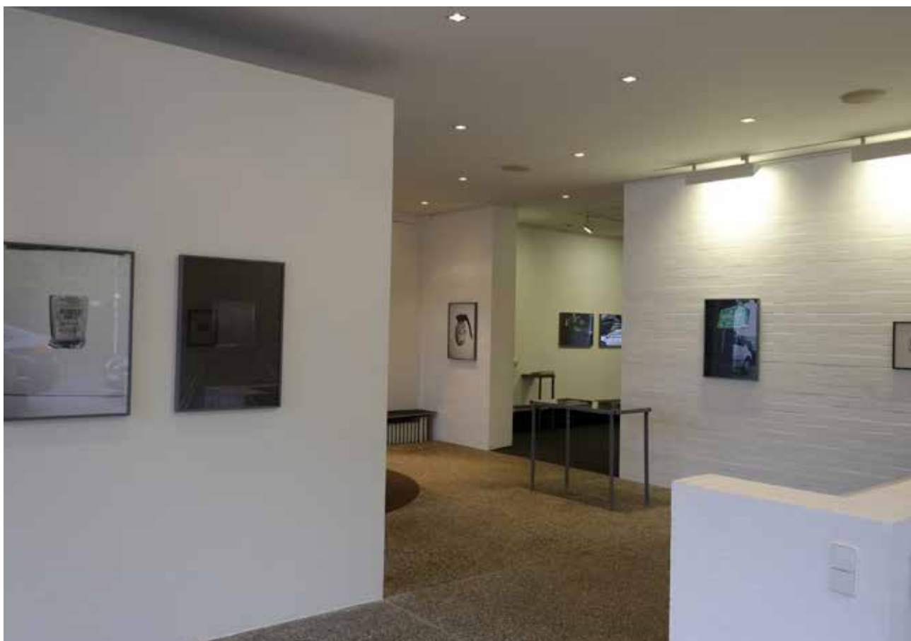
Gallery1: #7, War what is it good for«, #3, Play a part in history