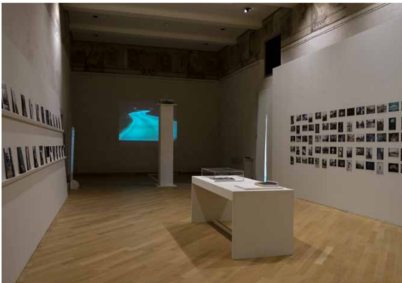
above: »You and Me« Fotografia Europea, Reggio Emilia 2016 incl. 195 prints, 3 videos, diary publications