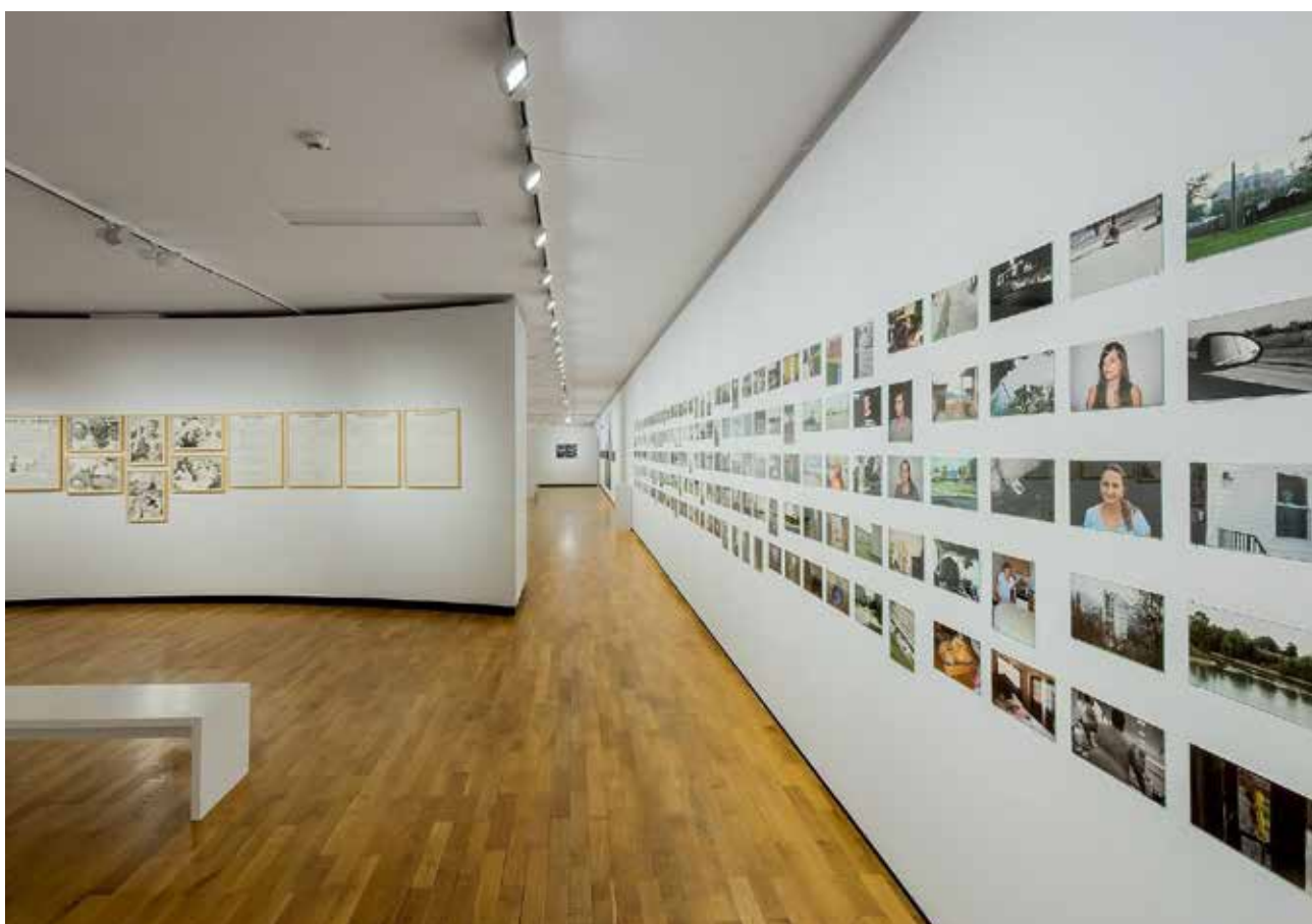
below: »You and Me« as part of »Past is Now« [G] Stadtmuseum München